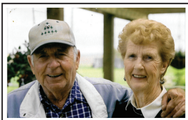
Piche-Hawkins-Grondin Funeral Chapels Assiniboia & Gravelbourg